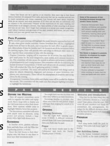
2006 POW WOW SCCC